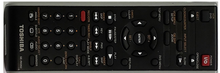
DVD / VCR Remote

Hearing Assist Devices are available in the Main Office.